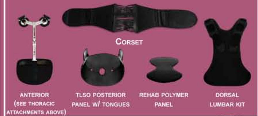
ANTERIOR (SEE THORACIC ATTACHMENTS ABOVE)