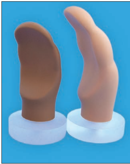
Patent # 5,085,665