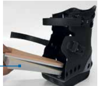
Wedge-shaped sole system for optimal rear weight-bearing