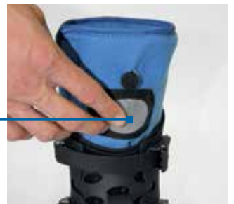
Perfect fit through air compression