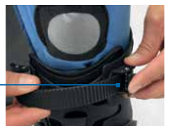
Practical closure system